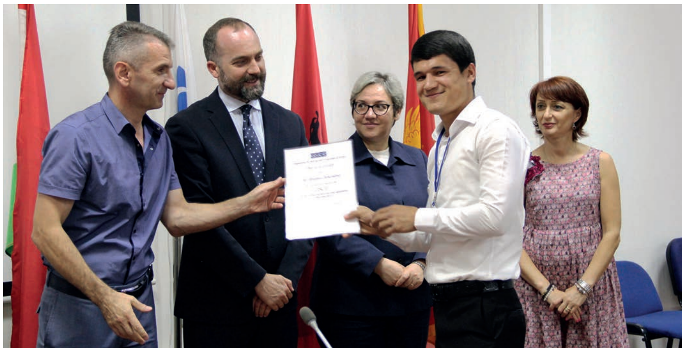
A participant in a three-day workshop on Operating Joint Border Crossing Points is awarded a certificate of attendance, Dushanbe, 26 June 2018.

implemented a multi-annual programme to support regional trade in Central Asia, including a focus on improved transport infrastructure and the elimination of non-tariff trade barriers. 43 UNDP has identified 'increased regional co-operation to enhance connectivity and legal movement of people, goods and services and to manage transboundary water resources more effectively' in its country strategy for Tajikistan, 44 and focuses on 'the nexus of inclusive and sustainable development, governance, and regional co-operation' in its country programme for Kazakhstan. 45