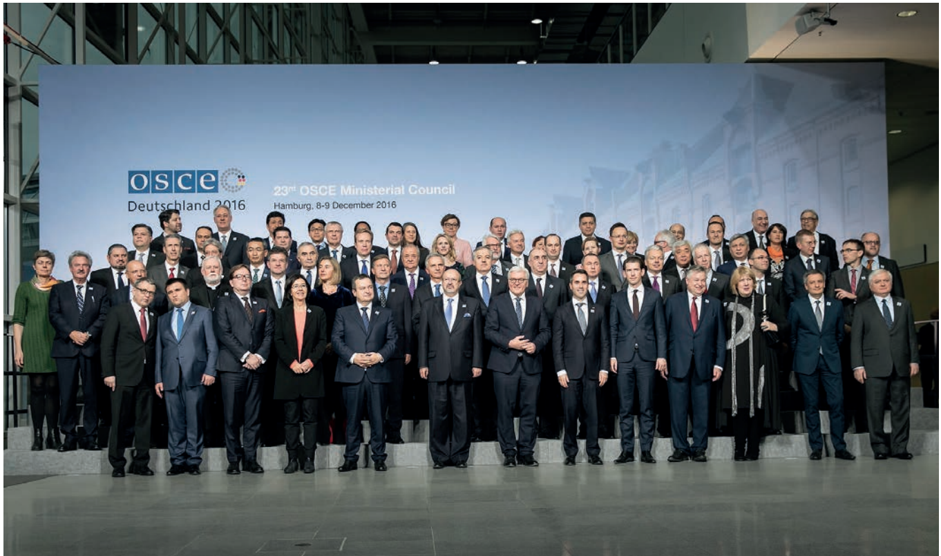
23rd OSCE Ministerial Council, Hamburg, 6–9 December, 2016.

The crisis in and around Ukraine since late 2013 has forced governments to rethink previous approaches and to re-evaluate the OSCE as a forum for addressing security issues. This was not without logic because the necessity to choose between EEU membership and an Association Agreement (AA), including a Deep and Comprehensive Free Trade Area (DCFTA), with the European Union had been presented as a civilizational choice and proved highly divisive in Ukraine. As the crisis deepened and security and human rights issues became more and more contested in the OSCE, the second dimension has come to be seen as a place where engagement and agreements among participating States are still possible.