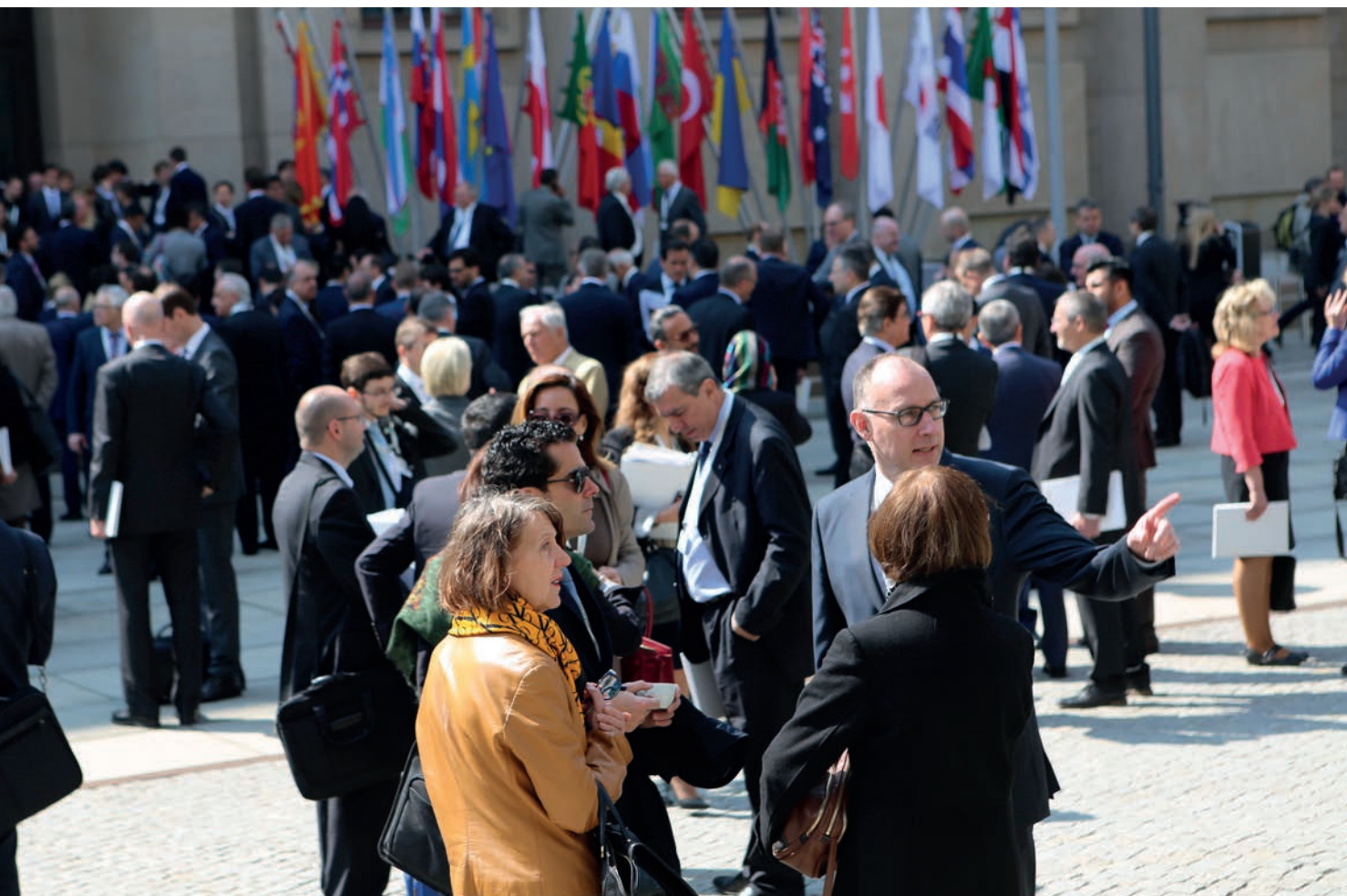
Participants get ready for the Conference on Connectivity for Commerce and Investment hosted by the German OSCE Chairmanship in Berlin on 18 and 19 May 2016.

common standards, dispute resolution, etc. 12 Thus, using economic diplomacy to facilitate trade not only enhances economic connectivity but it can also contribute more generally to security and stability within countries, and within and across sub-regions of the OSCE area.