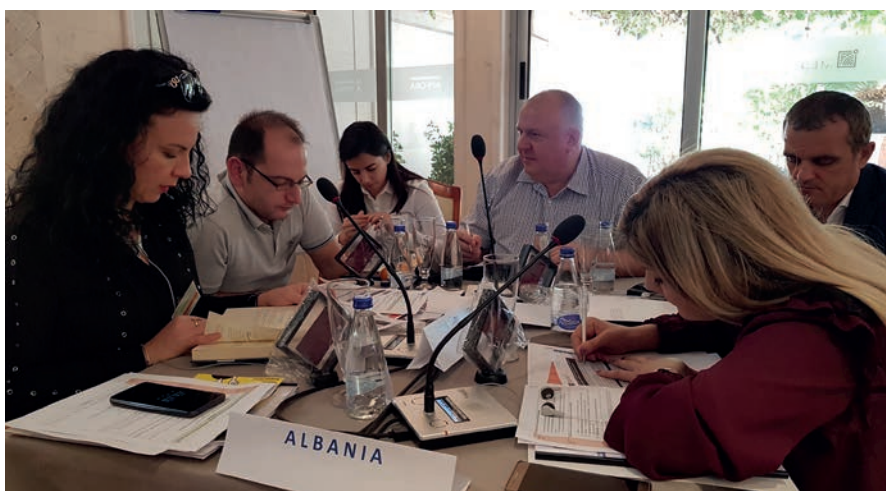
Participants during the Country Working Group Session drafting the National Roadmap on how to join the ICAO Public Key Directory (PKD), a central repository for exchanging the information required to authenticate ePassports, in Budva, Montenegro, 15–16 November 2018.

They are potentially applicable at different phases in the conflict cycle. Participating States should, therefore, 'make greater use of confidence-building and confidence- and security-building measures.' 110 They are part of a broader category of non-military confidence-building measures (CBMs). In this context it is also important to bear in mind that '[c]ross-border and inter-community trade can also help provide a basis for dialogue and a co-operative approach to joint problem-solving beyond the economic domain.' 111