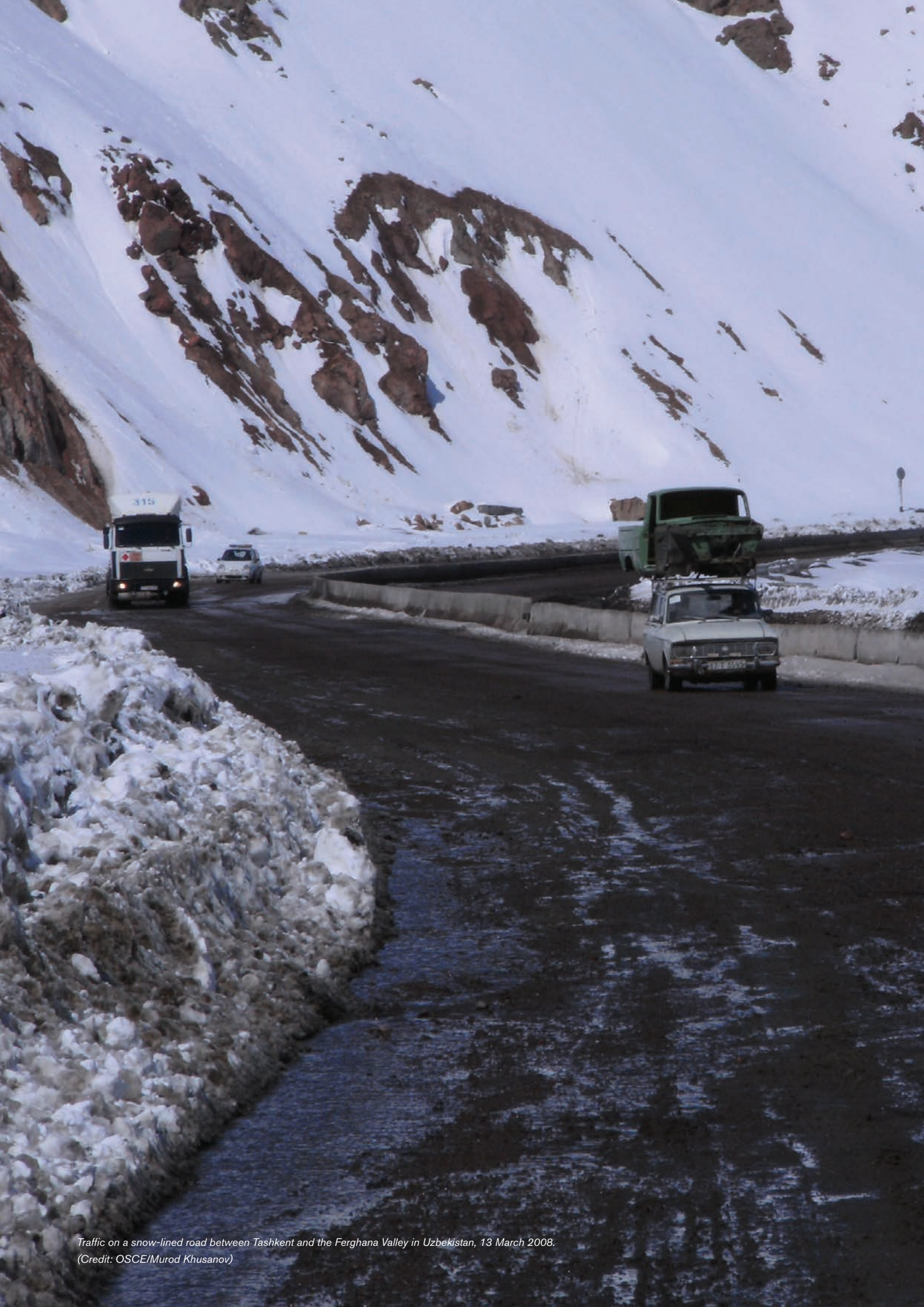
Traffic on a snow-lined road between Tashkent and the Ferghana Valley in Uzbekistan, 13 March 2008.