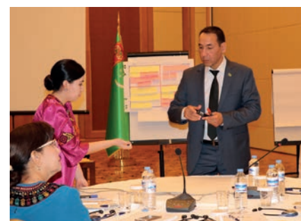
Participants during the OSCE-organised seminar on the potential of labour migration for the economic development of Turkmenistan, 29 August 2018.

In terms of digital connectivity, a similar cross-regional project, Digital CASA, has been developed and implemented since 2016. 51 It focuses on the development of a regionally integrated digital infrastructure, a supportive regulatory and institutional framework, lower cost and higher quality of internet access, and leveraging private sector investments in network infrastructure at both regional and national levels. Similar to projects aimed at energy connectivity and trade facilitation, the approach taken here is to achieve regional and cross-regional connectivity through a focus on national stakeholder needs and interests. This respects different national contexts without entrenching or increasing regional fragmentation.