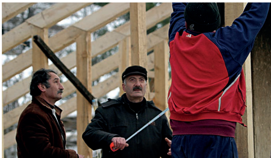
Workers from Ossetian contractor Bessarion carry out urgent renovations to a school in Dzari in the north of the Georgian-Ossetian zone of conflict – one of many projects by the OSCE Mission to Georgia-led Economic Rehabilitation Programme.

Following the fighting in 2008, the need for enhanced economic connectivity in Georgia's conflict zones has not diminished. Gradually, new opportunities have been created by a mix of local and international actors, including in the context of the Geneva International Discussions, co-chaired by the EU, the OSCE, and the United Nations. In the context of these discussions, the OSCE has implemented a number of concrete projects to reconnect communities on both sides of the administrative boundary line, including a dam safety project in Zonkari, a drinking water project in Znauri, and an irrigation project in Nikosi. 87