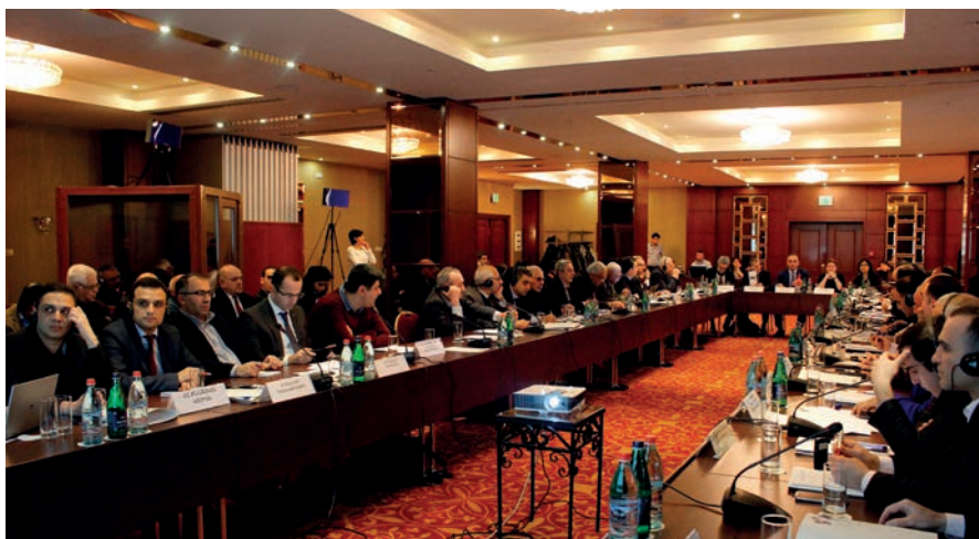
Representatives from government structures, parliament, the private sector and experts in the field discuss cyber security regulatory frameworks at an OSCE-supported conference, Yerevan, 23 March 2016.

The project of an International North-South Transport Corridor, which would connect Russia, Azerbaijan, Iran and India via road, rail and sea, remains behind schedule, while efforts to connect Armenia, Georgia and Russia are hampered by poor relations