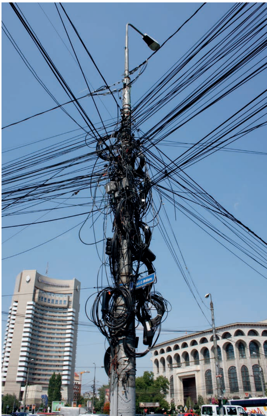
Tangled wires.

These, too, can make a critical contribution to shaping the direction of economic diplomacy towards enhancing connectivity. It is important, however, to bear in mind that the OSCE as an actor is very distinct from its participating States, state-like actors and partners in the private sector and among other international and regional organisations.