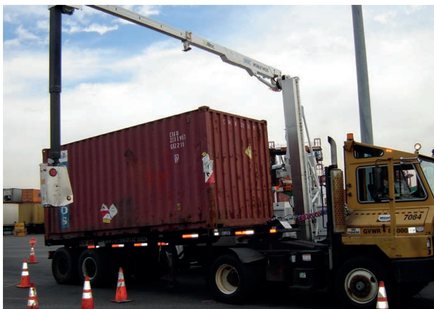
The OSCE is examining ways of enhancing container security in order to prevent terrorists exploiting this means of transport.

The ERP started with a needs assessment in 2005, which generated a list of priority projects in the area of socio-economic infrastructure rehabilitation in the Georgian-South Ossetian conflict zone and its surrounding areas. This was followed by an international donor conference in June 2006, hosted by the then Belgian OSCE Chairmanship, which resulted in close to €8 million in pledges from 21 donors, with the EU alone committing €2 million. The ERP was then officially launched in October 2006 at the first meeting of its Steering Committee which took place in the Tskhinvali branch office. 83 Projects subsequently implemented until 2008 were focused on three main areas: business skills training, agricultural