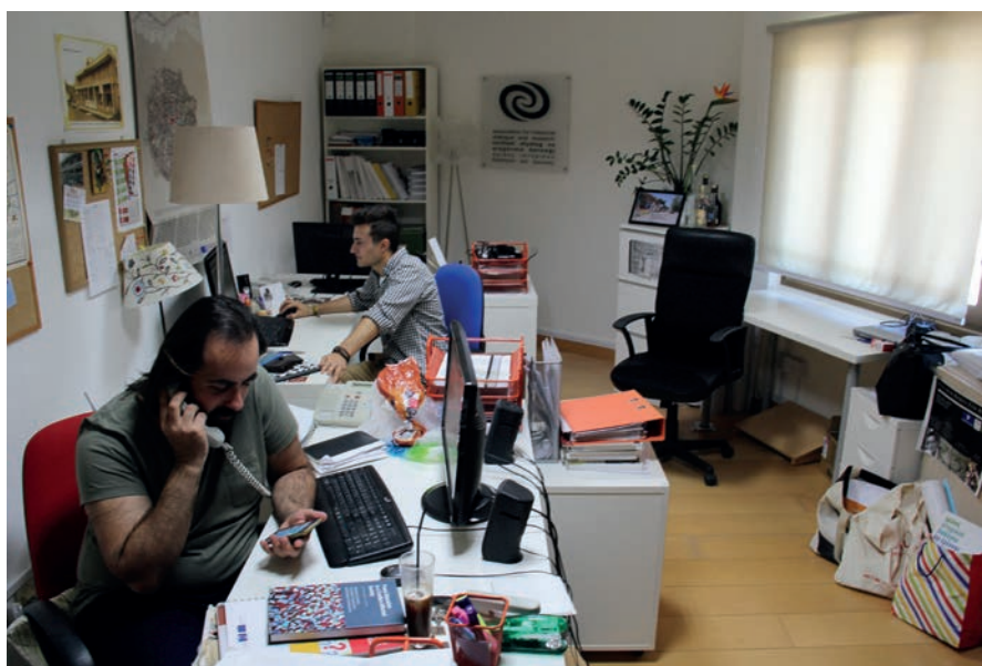
Staff of the Association for Historical Dialogue and Research, winners of the 2016 Max van der Stoep award, at the Home for Co-operation in Cyprus, September 2016.

Another dimension of economic connectivity attended to by UNDP and its partners is the removal of physical barriers to economic connectivity. In the context of Cyprus, this has been relevant in relation to landmine and ordnance clearance and the improvement and restoration of physical infrastructure connecting the two communities. Between 2004 and 2011, UNDP, together with the United Nations Peacekeeping Force in Cyprus, the United Nations Office for Project Services, the UN Mine Action Centre, and the European Commission, implemented a project to reduce the number of landmines in the so-called buffer zone in order to facilitate safer inter-community movement and restore access to agricultural land. As a result of the project, over 27,000 land mines were cleared, resulting in 81 former minefields being declared mine-free and almost 11 million square meters of land being returned to civilian use. 73 Of similar importance were infrastructure rehabilitation projects facilitating the re-opening of crossing points across the Green Line. UNDP, for example, co-ordinated the redevelopment of the road between Kato Pyrgos and Limnitis/Yeşilirmak along the seventh crossing on the island, which was funded jointly by the Government of Cyprus, the EU and USAID.