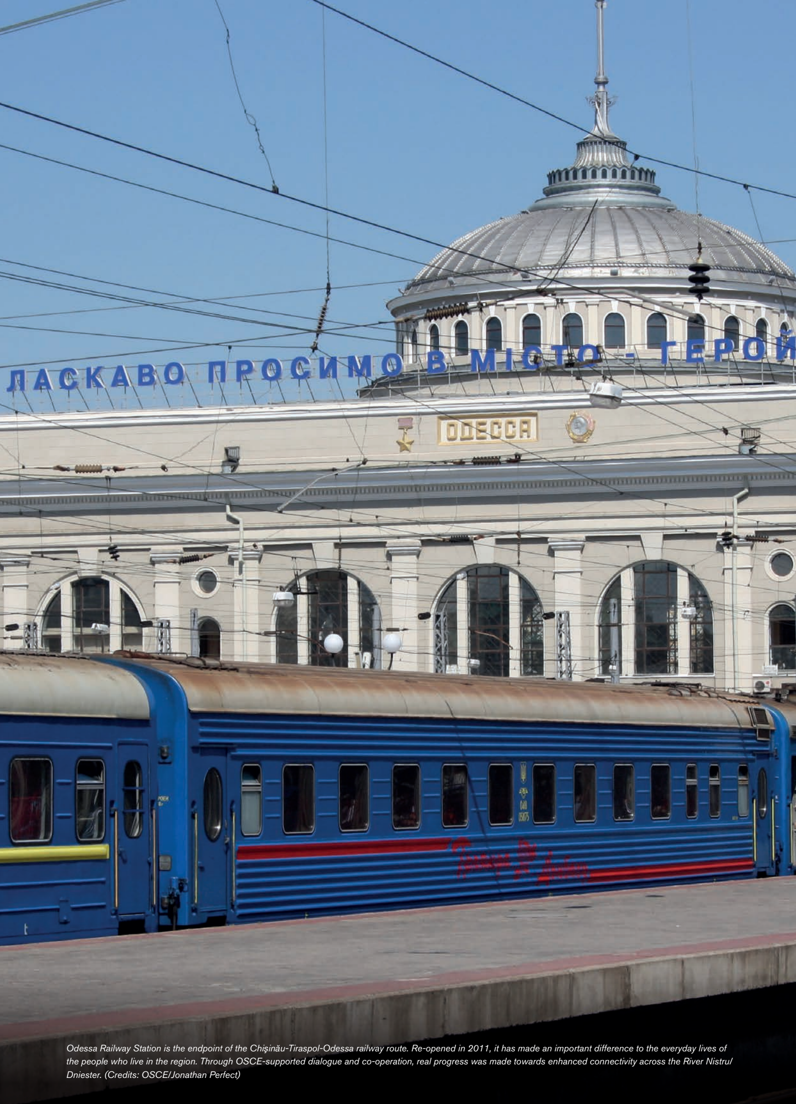
Odessa Railway Station is the endpoint of the Chişinău-Tiraspol-Odessa railway route. Re-opened in 2011, it has made an important difference to the everyday lives of the people who live in the region. Through OSCE-supported dialogue and co-operation, real progress was made towards enhanced connectivity across the River Nistru/ Dniester.