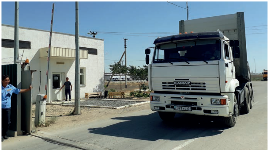
Zone of customs control in Aktau, Kazakhstan, 29 August 2018.

Connectivity in Central Asia has been as much a political as an economic issue and one that has been driven from both inside and outside the region. Consequently, the dynamics of economic diplomacy and