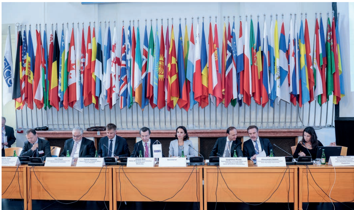
Speakers of the Concluding Meeting of the 26th OSCE Economic and Environmental Forum, Prague, 5–7 September 2018.

contexts but remain connected to them within the broader OSCE context. Providing evidence on technically viable solutions to restore, strengthen, and enhance economic connectivity could then inform a reappraisal of the political feasibility of particular connectivity projects. An OSCE connectivity platform, enriched and used in this way by individual Chairmanships, would not only contribute to the OSCE's confidence-building mandate but would also offer a sustainable pathway to reinvigorating the OSCE's second dimension for that purpose as envisaged in the Helsinki Final Act.