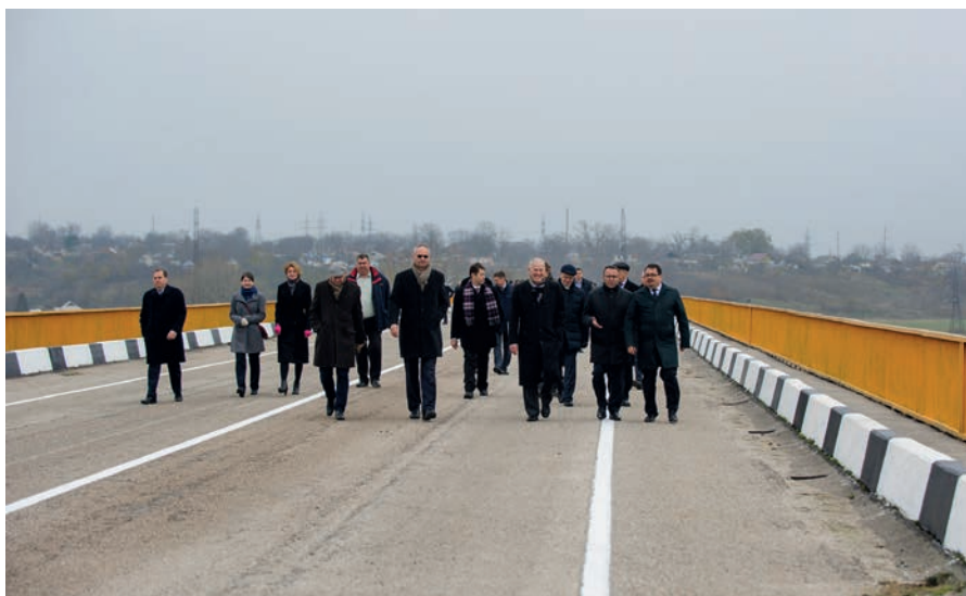
The historic decision to open the Gura Bicului–Bychok Bridge on 18 November 2017 symbolises a breakthrough in the Transnistrian settlement process. It led to the signing by the sides of five additional agreements in the end of 2017 and spring of 2018.

The European Union Border Assistance Mission to Moldova and Ukraine (EUBAM), established in 2005, has also made a significant contribution to enhancing economic connectivity. In a 2015 Addendum to the original 2005 Memorandum of Understanding between the EU, Moldova, and Ukraine, the Mission's conflict settlement objective was substantially expanded and refined, stressing that the Mission was '[t]o contribute to the settlement of the Transnistrian conflict by, inter alia , strengthening the border management and customs regime, and confidence-building measures, thus favouring interaction and exchanges between the two banks of the Nistru/Dniester river and contributing to reducing possible security threats.' 102