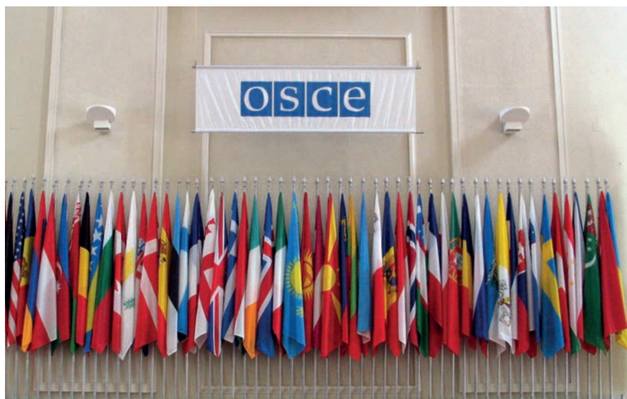
Flags of the OSCE participating States.

the OSCE is given a role to help countries master the transition by addressing illegal economic activities, governance and environmental problems and enhancing co-operation. The participating States also agreed that regional integration processes should 'take due account of the economic interests of other participating States and do not contribute to the creation of new divisions'. Regarding trade facilitation, the participating States committed themselves to making progress on the harmonisation of regulations and standards, and the elimination of customs duties. Yet, overall the text falls short of a real enhancement of the Organization's role in those issues. It only endows the Organization with a subsidiary function as a forum for dialogue and a catalyst for progress in other, 'more appropriate' fora.