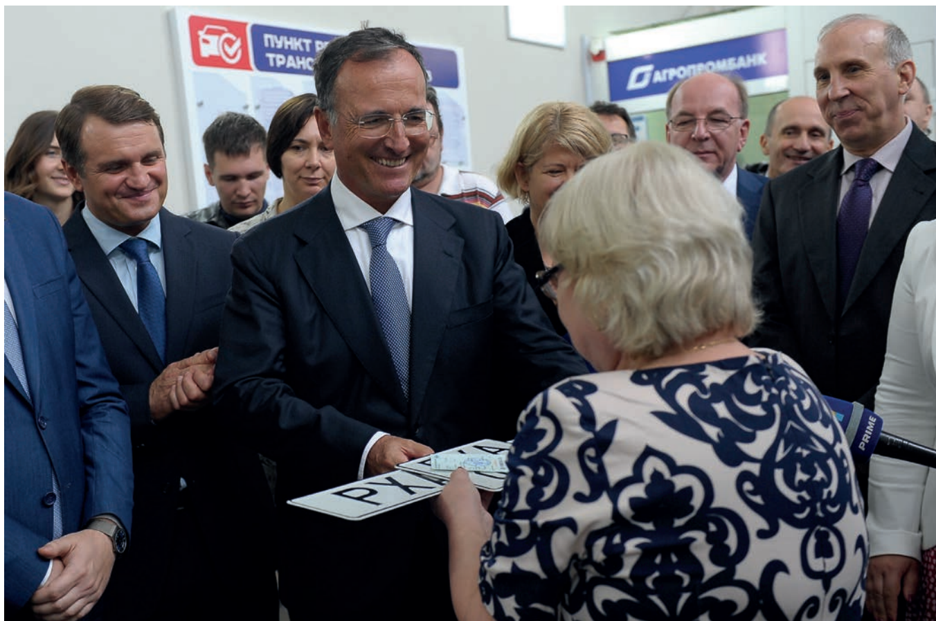
Franco Frattini, the Special Representative of the OSCE Chairperson-in-Office for the Transdniestrian Settlement Process, hands over the first Moldovan neutral-design licence plates at a Vehicle Registration Office (VRO) in Tiraspol, 10 September 2018.

EUBAM has, since then, also contributed to supporting 'the smooth implementation of border customs-related aspects of the Association Agreements', including the DCFTAs. 103 As part of this effort, the Mission set up a Trade Facilitation Working Group in 2015, which 'acts as a platform for communications and co-operation between Moldovan and Ukrainian Customs, national and provincial government agencies, business and key development partners including USAID, the American Chamber of Commerce, the European Business Association and the Odesa Business Forum.' 104 While 'focused on implementation of legislative and procedural measures necessary to fulfil commitments of both countries under AA/DCFTA and Customs Chapters of the WTO Agreement', the Working Group was also instrumental in developing and sustaining public-private co-operation in trade facilitation.