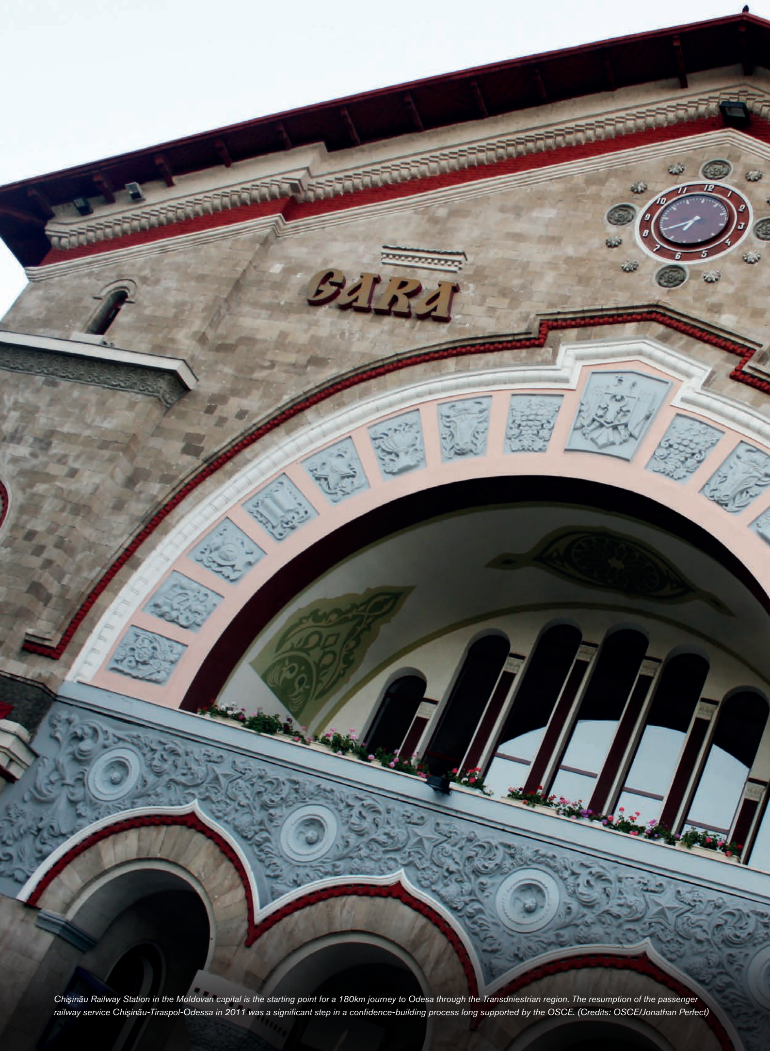
Chişinău Railway Station in the Moldovan capital is the starting point for a 180km journey to Odesa through the Transdnistrian region. The resumption of the passenger railway service Chişinău-Tiraspol-Odesa in 2011 was a significant step in a confidence-building process long supported by the OSCE.