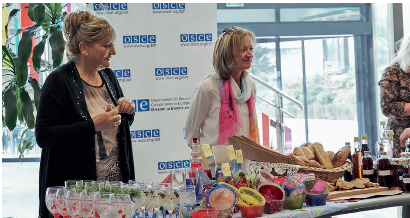
Participants at the OSCE-supported 'Women's Entrepreneurship Fair', Sarajevo, Bosnia and Herzegovina, 17 October 2018.

The EU's Connectivity Agenda for the Western Balkans has its origins in the Berlin Process in 2014. 63 Since then, the EU and the WB6 have explicitly recognised that well-connected networks of transport